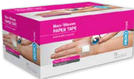
Microporous Paper Tape 24pk AP312 1.25cm x 5M | RRP $0.99ea