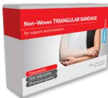
Non-Woven Disposable Tri Bandage