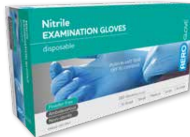
Nitrile Gloves Powder Free 100pk AGNPF01-S Small | RRP $19.99