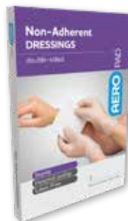
Low Adherent Dressing Pad 3pk APD1013S 10cm x 10cm | RRP $5.99