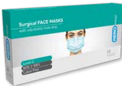
Surgical L2 Face Mask 10pk