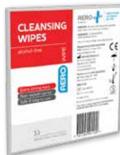
Alcohol-Free Cleansing Wipes 10pk AW8110 200mm x 100mm | RRP $4.99