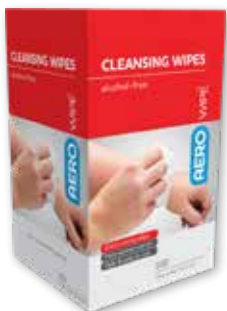
Alcohol-Free Cleansing Wipes 100pk AW8100 200mm x 100mm | RRP $0.49