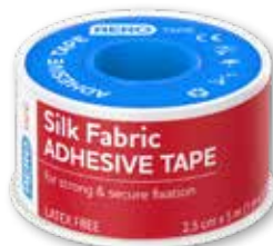
Fabric Adhesive Tape