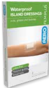
Waterproof Island Dressing 3pk AFPW0063 6cm x 7cm | RRP $6.99