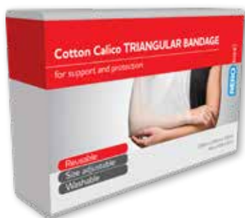
Calico Triangular Bandage