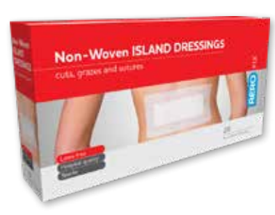
Island Dressing 20pk