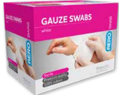
Sterile Gauze Swab 5pk | 25bx AGS755S 7.5cm x 7.5cm | RRP $1.39ea