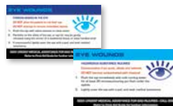
Eye Wound First Aid Card