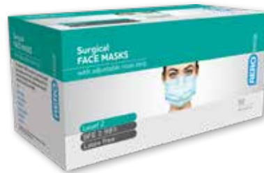
Surgical L2 Face Mask 50pk