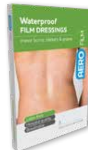
Waterproof Film Dressing 3pk