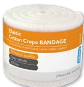
Elastic Cotton Crepe Bandage