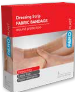
Dressing Strip Roll 1Roll AFP610 6cm x 1M | RRP $4.99