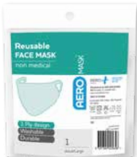
Reusable Adult Face Mask