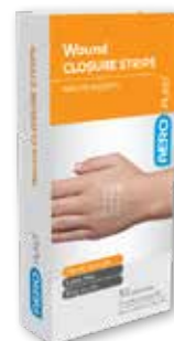
Wound Closure Strips Card 3 | 50pk