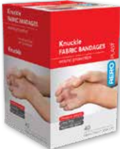
Knuckle Dressing 40pk AFP350 7.5cm x 3.8cm | RRP $24.99