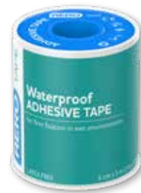
Waterproof Adhesive Tape