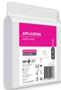
Double End Applicators 100pk