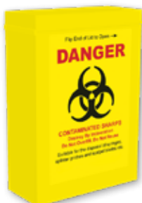
Needle Disposal Unit ND90 90ml | RRP $3.99

Also Available Biohazard Chemical Waste Bags BHB6380 50L BHB49120 120L