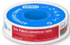
Fabric Adhesive Tape