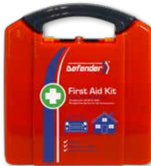
Defender Orange Plastic Kit AFAK3P Large | RRP $49.99