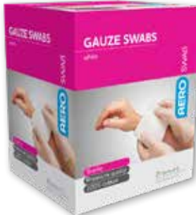
Sterile Gauze Swab 3pk | 25bx AGS753S 7.5cm x 7.5cm | RRP $1.24ea