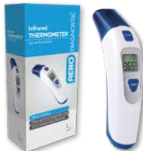
Infrared Ear & Forehead Thermometer