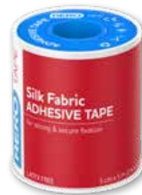
Fabric Adhesive Tape