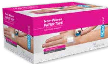
Microporous Paper Tape 12pk AP325 2.5cm x 5M | RRP $1.99ea