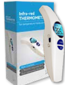
Infrared Non-Contact Thermometer