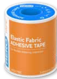
Elastic Adhesive Tape