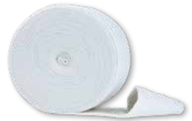
Size C | Adult Limbs