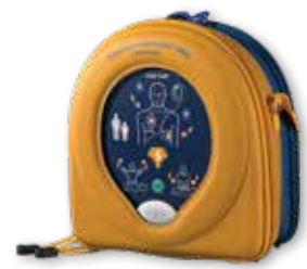
Defib Samaritan Pad PAD-350P Semi Automatic 8 Year Warranty Free Online Training