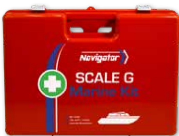
Navigator Rugged Marine G AFAKGM Large | RRP $259.99