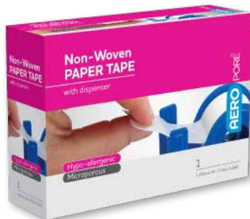
Microporous Tape with Dispenser AP312D 1.25cm x 9.1M | RRP $2.49