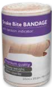
Snake Bite Indicator Bandage AFHSB100 10cm x 10.5M | RRP $14.95