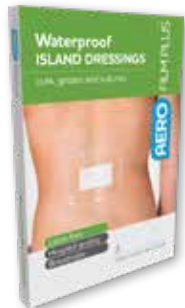
Waterproof Island Dressing 3pk AFPW0103 10cm x 12cm | RRP $11.99