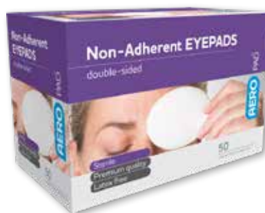
Eye Pad 50pk AEP1S 5.5cm x 7.7cm | RRP $0.59ea