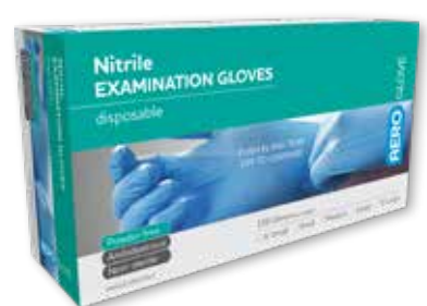
Nitrile Gloves Powder Free 100pk AGNPF01-M Medium | RRP $19.99