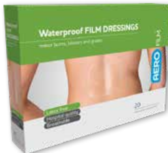
Waterproof Film Dressing 20pk