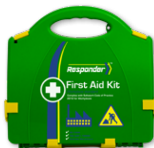
Responder Workplace Plastic Kit AFAK4P Sml Workplace | RRP $89.99