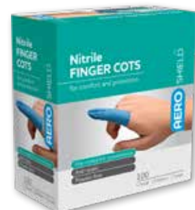
Nitrile Finger Cots 100pk ASN100 Large | RRP $19.99