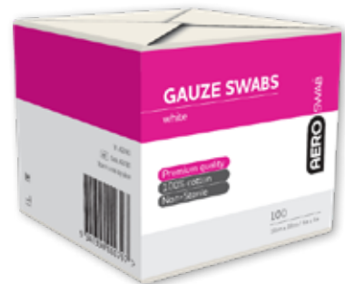
8 ply Gauze Swab 100pk AGS100 10cm x 10cm | RRP $8.99