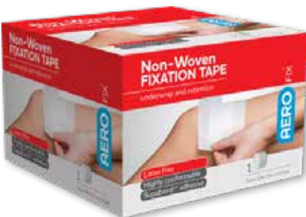
Dressing Retention Roll