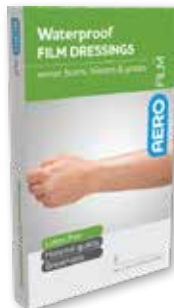
Waterproof Film Dressing 3pk