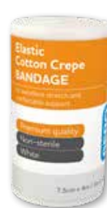
Elastic Cotton Crepe Bandage