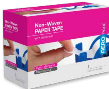
Microporous Tape with Dispenser AP325D 2.5cm x 9.1M | RRP $4.49