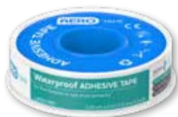
Waterproof Adhesive Tape