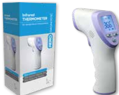
Infrared Pistol Grip Thermometer