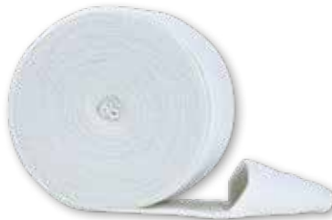
Size E | Adult Legs