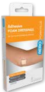
Waterproof Foam Dressing 2pk AFPA0252 5cm x 5cm | RRP $6.99