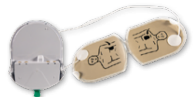
Adult Pad-Pak (Grey) PAD-PAK-03

Contact us for wholesale pricing and package deals on Defibrillator purchases