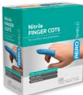
Nitrile Finger Cots 100pk ASN100 Medium | RRP $19.99