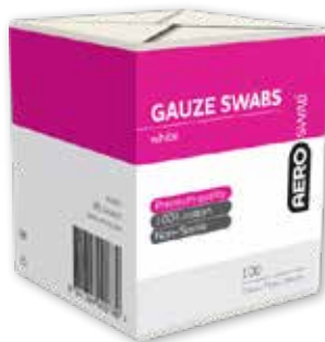
8 ply Gauze Swab 100pk AGS75 7.5cm x 7.5cm | RRP $5.99