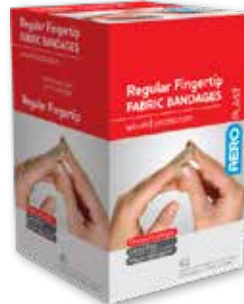
Regular Fingertip Dressing 40pk AFP430 6.0cm x 4.5cm | RRP $19.99