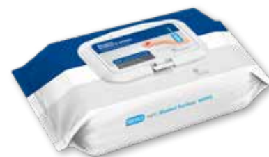
Alcohol Surface Wipes 60pk AW7600 15cm x 18cm | RRP $9.99