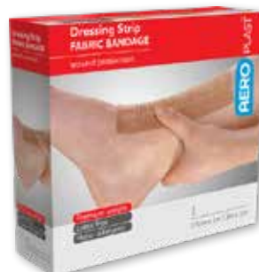
Dressing Strip Roll 1Roll AFP701 7.5cm x 1M | RRP $4.99