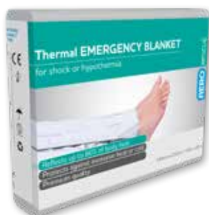
Emergency Thermal Blanket