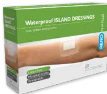
Waterproof Island Dressing 20pk AFPW00620 6cm x 7cm | RRP $2.49ea