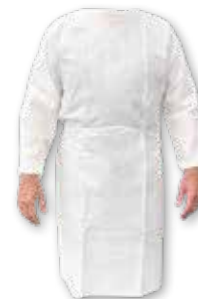
Disposable Fluid Resistant Gown ASGN01 One Size Fits All | RRP $3.99