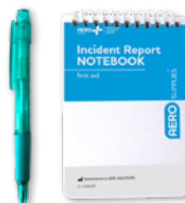
First Aid Notebook with Pen