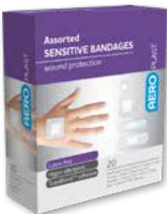
Assorted Dressings 20pk