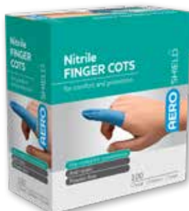
Nitrile Finger Cots 100pk ASN100 Small | RRP $19.99