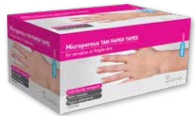
Microporous Tan Paper Tape 12pk AP325T 2.5cm x 5M | RRP $1.99ea