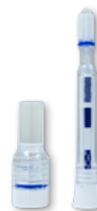
COVID-19 Rapid Antigen Test 2pk