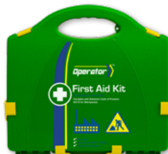
Operator Workplace Plastic Kit