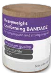
Heavy Weight Conforming Bandage