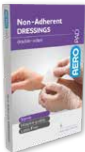
Low Adherent Dressing Pad 5pk APD505S 5cm x 5cm | RRP $3.99