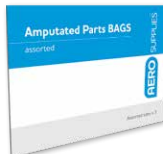
Amputated Parts Bag 3pk AAB100 Assorted | RRP $0.99