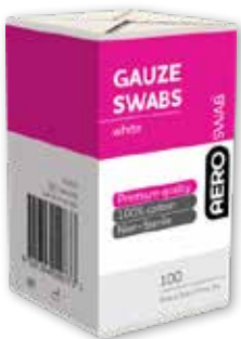
8 ply Gauze Swab 100pk AGS50 5cm x 5cm | RRP $3.99