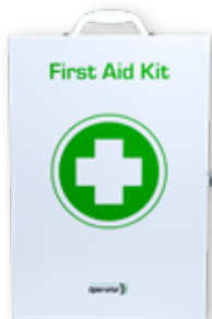
Operator Workplace Metal Cabinet Kit