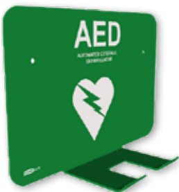
Defib Wall Bracket CA-BR1