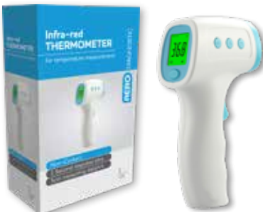
Infrared Pistol Grip Thermometer