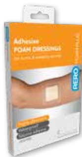
Waterproof Foam Dressing 2pk AFPA0372 7.5cm x 7.5cm | RRP $9.99