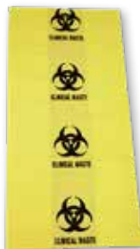
Biohazard Chemical Waste Bag BHB3547 10L | RRP $0.50