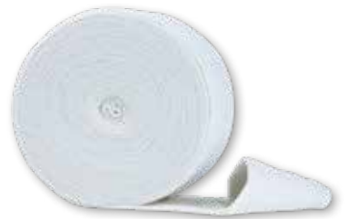
Size F | Large Adult Legs