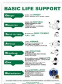
CPR Wall Chart