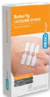
Butterfly Wound Closures 10pk