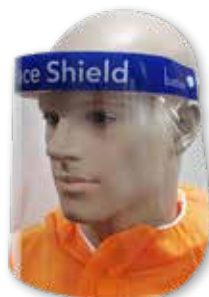
Disposable Plastic Face Shield ASFS01 One Size Fits All | RRP $3.99