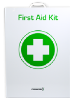
Commander Workplace Metal Cabinet Kit AFAK6M Lge Workplace | RRP $299.99