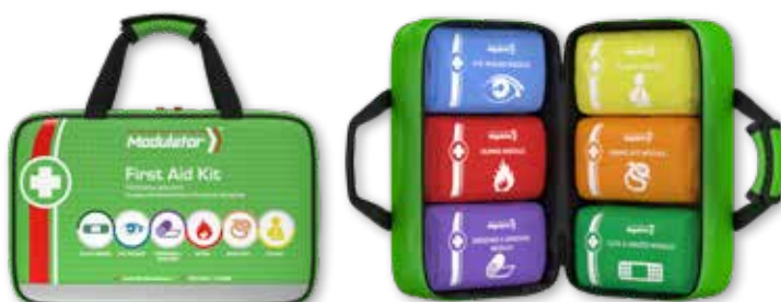
The Modulator 4 Series Plus Kit AFKMODS4 Large | RRP $159.99