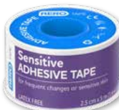
Sensitive Adhesive Tape