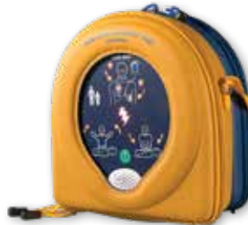
Defib Samaritan Pad PAD-360P Autoshock 8 Year Warranty Free Online Training