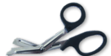
Universal Scissors USP19 19cm | RRP $3.99