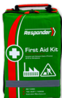
Responder Workplace Softpack Kit AFAK4S Sml Workplace | RRP $89.99