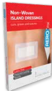
Island Dressing 3pk