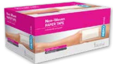
Microporous Paper Tape 6pk AP350 5cm x 5M | RRP $3.99ea