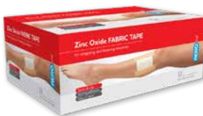
Zinc Oxide Tape 12pk AFT25 2.5cm x 5M | RRP $4.99