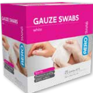
Sterile Gauze Swab 3pk | 25bx AGS103S 10cm x 10cm | RRP $1.49ea