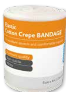
Elastic Cotton Crepe Bandage