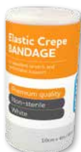
Elastic Cotton Crepe Bandage