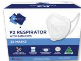
P2 Respirator Adult Mask 25pk