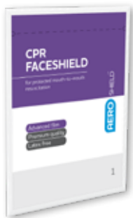
Face Shield Disposable AFS001 One Size | RRP $3.99