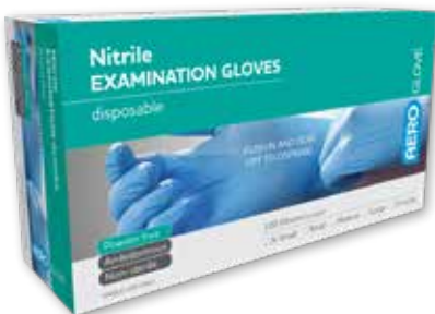
Nitrile Gloves Powder Free 100pk AGNPF01-L Large | RRP $19.99