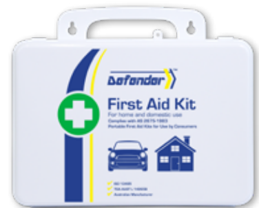
Defender Waterproof Plastic Kit AFAK3W Large | RRP $49.99