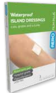
Waterproof Island Dressing 3pk AFPW0093 9cm x 10cm | RRP $9.99