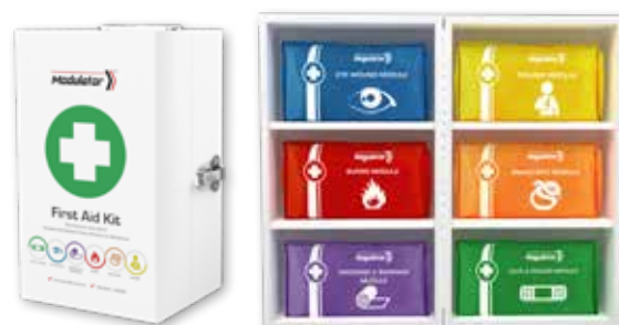
The Modulator 4 Series Plus Kit AFKMODM4 Large | RRP $179.99