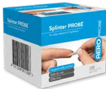
Splinter Probes 100pk ASP100 3.7cm | RRP $19.80