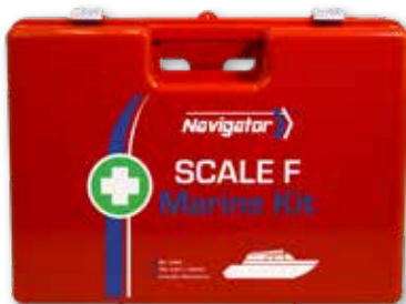
Navigator Rugged Marine F AFAKFM Large | RRP $319.99

MARINE KITS EXCLUDE SCHEDULED MEDICATIONS