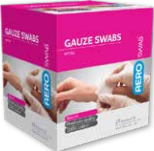
Sterile Gauze Swab 3pk | 25bx AGS53S 5cm x 5cm | RRP $0.99ea