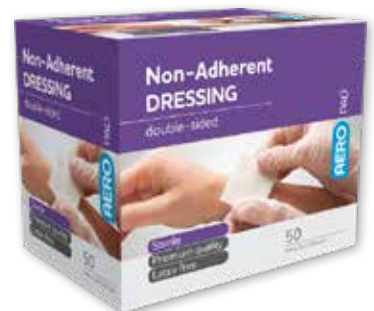
Low Adherent Dressing Pad 50pk APD50S 5cm x 5cm | RRP $0.59ea