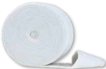
Size A | Infant Limbs