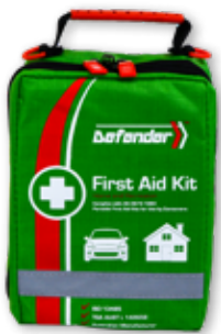
Defender Green Softpack AFAK3S Large | RRP $49.99