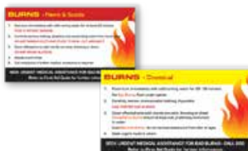
Burns First Aid Card