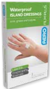
Waterproof Island Dressing 3pk AFPW0043 4cm x 5cm | RRP $4.99