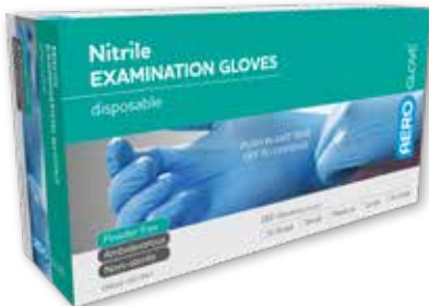
Nitrile Gloves Powder Free 100pk AGNPF01-XS X-Small | RRP $19.99