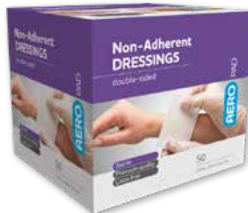
Low Adherent Dressing Pad 50pk APD100S 10cm x 7.5cm | RRP $1.49ea