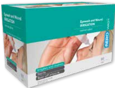
Sodium Chloride Eye Wash Ampoule 60pk