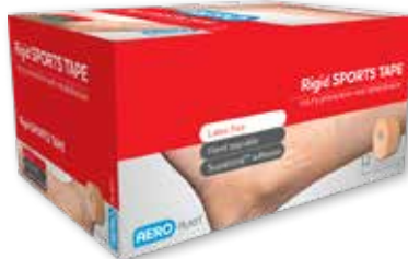
Latex Free Rigid Tape 12pk