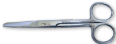
Scissors - S/S - Sharp / Blunt ASC13 13cm | RRP $3.99