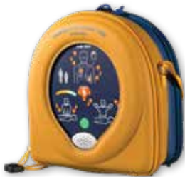
Defib Samaritan Pad PAD-500P CPR Advisor 8 Year Warranty Free Online Training