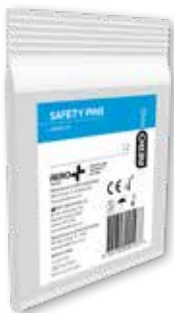
First Aid Safety Pins 12pk ASP12 Assorted | RRP $0.59