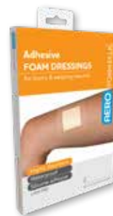
Waterproof Foam Dressing 2pk AFPA0052 10cm x 10cm | RRP $14.99