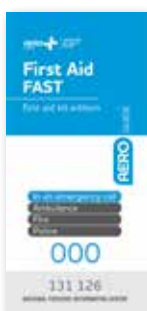
First Aid Leaflet