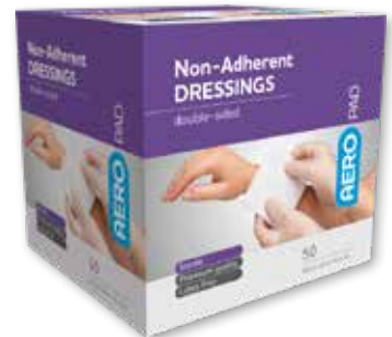
Low Adherent Dressing Pad 50pk APD101S 10cm x 10cm | RRP $1.99ea