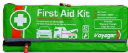
Voyager Road Safety Softpack Kit