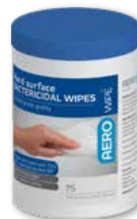
Hard Surface Alcohol Wipe 75 Tub AW7500 42cm x 14.5cm | RRP $11.99