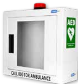
Alarmed W/Strobe Defib Wall Cabinet CC-50 42 x 38 x 15cm