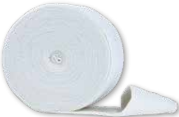
Size D | Large Adult Limbs