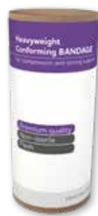
Heavy Weight Conforming Bandage