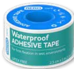
Waterproof Adhesive Tape