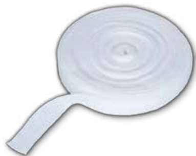
Tubular Finger Bandage