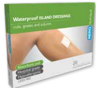
Waterproof Island Dressing 20pk AFPW009 9cm x 10cm | RRP $2.99ea