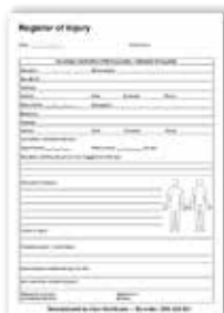
Register of Injuries Pad 25pg Duplicate