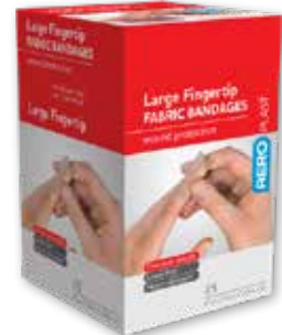
Large Fingertip Dressing 25pk AFP450 7.5cm x 4.5cm | RRP $17.99