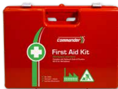
Commander Workplace Rugged Plastic Kit AFAK6C Lge Workplace | RRP $249.99