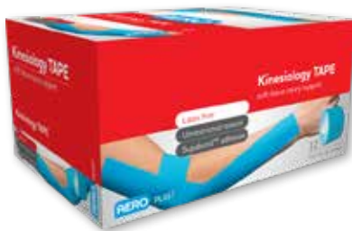
Latex Free Kinesiology Tape 12pk