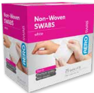
Sterile Non-Woven Swab 3pk | 25bx