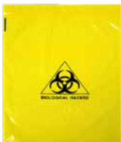
Biohazard Chemical Waste Bag BHB2538 4L | RRP $0.80