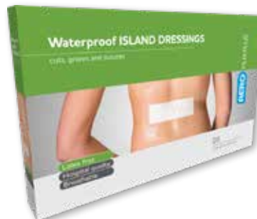
Waterproof Island Dressing 20pk AFPW015 15cm x 20cm | RRP $7.99ea