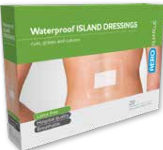
Waterproof Island Dressing 20pk AFPW010 10cm x 12cm | RRP $4.49ea