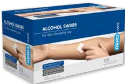
Alcohol Swabs (2ply) 100pk AW7100 30mm x 30mm | RRP $3.99