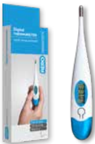
Digital Clinical Thermometer