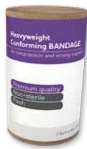
Heavy Weight Conforming Bandage