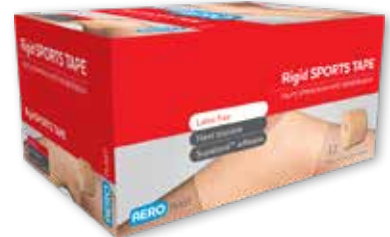
Latex Free Rigid Tape 12pk