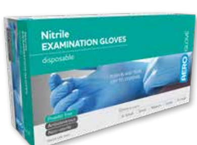
Nitrile Gloves Powder Free 95pk AGNPF01-XL X-Large | RRP $19.99