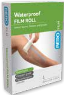
Waterproof Film Roll 1Roll