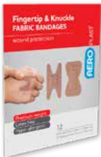
Fingertip & Knuckle Dressings 12env AFP312 Assorted Sizes | RRP $4.99