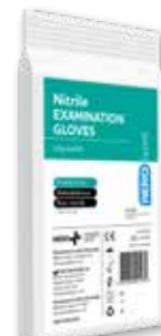
Nitrile Gloves (Pair) Powder Free AGNPF02 Large | RRP $0.99