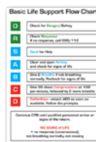
CPR Flow Chart Card