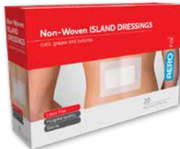
Island Dressing 20pk