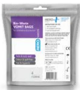
Vomit Bags with Wipes 4pk AW1514 1500ml | RRP $5.99