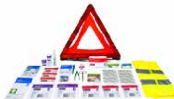
Voyager Refill Pack