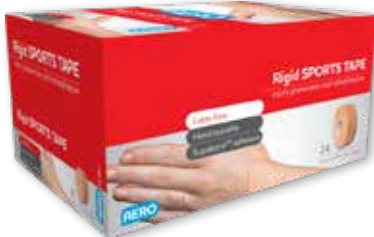
Latex Free Rigid Tape 24pk