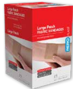
Large Patch 50pk AFP506 7.5cm x 5.0cm | RRP $17.99