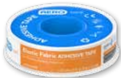
Elastic Adhesive Tape