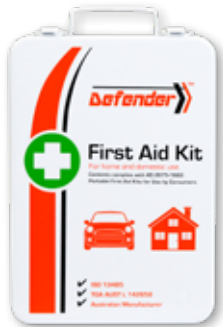
Defender Metal Box Kit AFAK3M Large | RRP $59.99