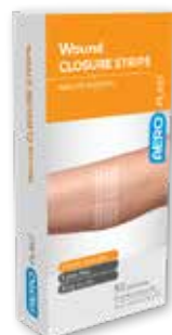
Wound Closure Strips Card 5 | 50pk