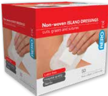
Island Dressing 50pk