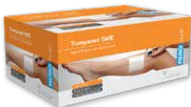
Transparent Tape Microperforated 12pk AT25 2.5cm x 5M | RRP $4.99ea