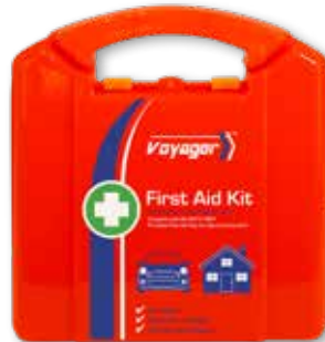
Voyager Orange Plastic Kit