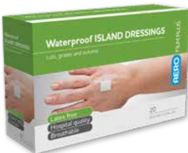
Waterproof Island Dressing 20pk AFPW00420 4cm x 5cm | RRP $1.49ea