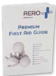
First Aid Booklet