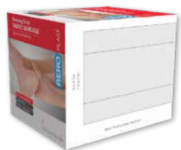
Dressing Strip Roll 5M 1Roll AFP705 7.5cm x 5M | RRP $19.99