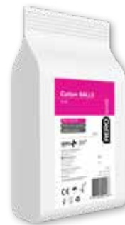
Cotton Balls 100pk