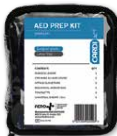
Defib Premium Prep Kit CA-PK1