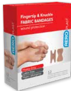
Fingertip & Knuckle Dressings 12pk AFP3012 Assorted Sizes | RRP $4.99