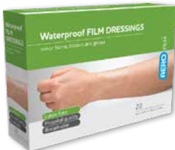
Waterproof Film Dressing 20pk