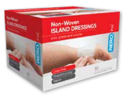
Island Dressing 50pk