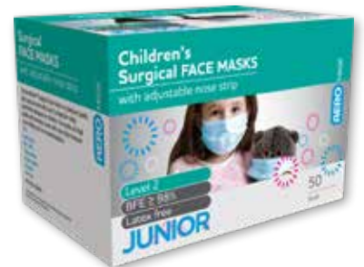
Surgical L2 Children's Face Mask 50pk