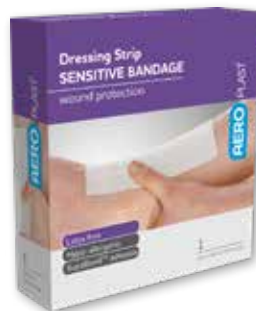
Dressing Strip Roll 1Roll