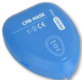
CPR Mask in Hard Cover AM01 One Size | RRP $19.99