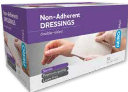
Low Adherent Dressing Pad 50pk APD102S 10cm x 20cm | RRP $2.99ea