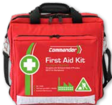
Commander Workplace Softpack Kit AFAK6S Lge Workplace | RRP $219.99