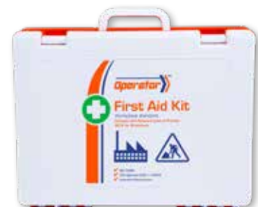
Operator Workplace Rugged Plastic Kit