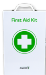
Responder Workplace Metal Cabinet Kit AFAK4M Sml Workplace | RRP $119.99