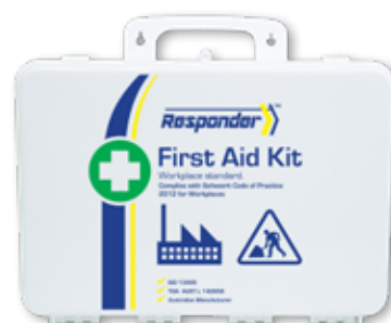
Responder Wproof Workplace Plastic Kit AFAK4W Sml Workplace | RRP $89.99