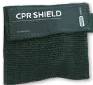
Key Ring CPR Face Shield ASK001 One Size | RRP $4.99