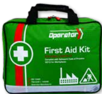
Operator Workplace Softpack Kit