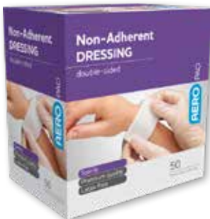
Low Adherent Dressing Pad 50pk APD75S 7.5cm x 5cm | RRP $0.99ea