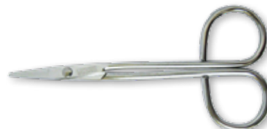
Scissors - S/S - Sharp/Sharp ASC11 11cm | RRP $2.99