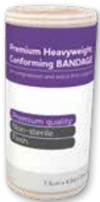
Premium Heavy Conforming Bandage AFHP75 7.5cm x 4.5M | RRP $8.95