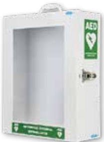
Standard Defib Wall Cabinet CC-25 47 x 37 x 14.5cm