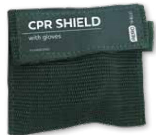
Key Ring CPR FaceShield + Gloves ASK002 One Size | RRP $6.99