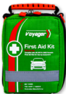
Voyager Green Softpack