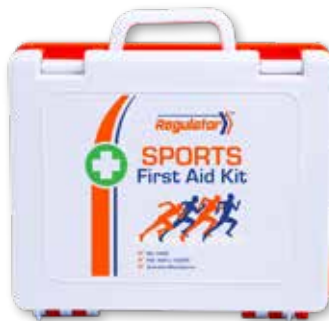
Defender Plastic Sports Kit AFAK3CS Sports | RRP $69.99