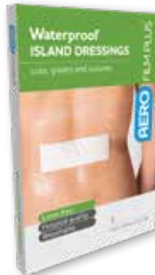
Waterproof Island Dressing 3pk AFPW0153 15cm x 20cm | RRP $17.99