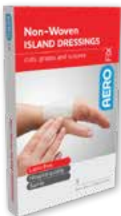
Island Dressing 5pk