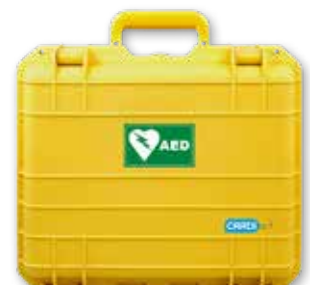
Tough Waterproof Defib Case CW-10 33 x 28 x 12cm