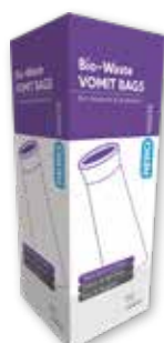
Vomit Bags 50pk AW1510 1500ml | RRP $0.99