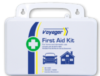
Voyager Waterproof Plastic Kit