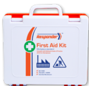
Responder Workplace Rugged Plastic Kit AFAK4C Sml Workplace | RRP $89.99