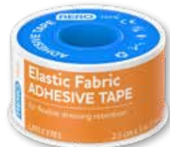
Elastic Adhesive Tape