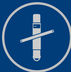
Tourniquet Application Trainers