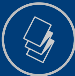
Simulated Hemostatic Gauze