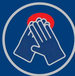
Tabletop Trainers for Classrooms