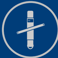
Tourniquet Application Trainers