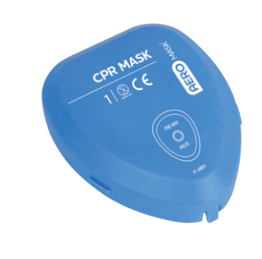
1 shield with case