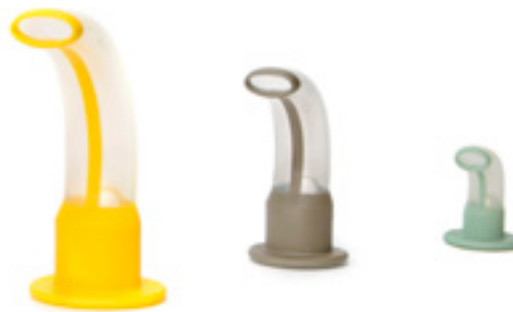
ISO Size 9.0

Each department will need to consider locally how this change will be implemented as it may take time for existing stock to be used.