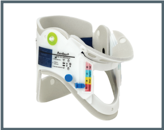
Ambu® Perfit ACE®