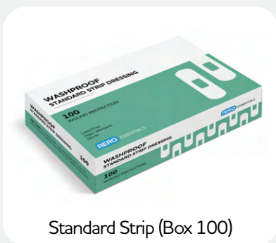
Standard Strip (Box 100)