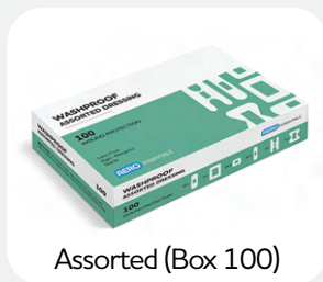
Assorted (Box 100)