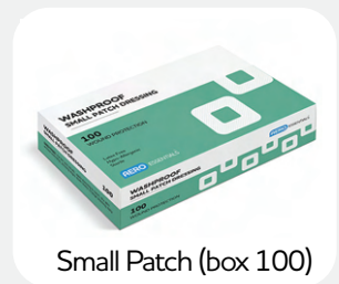
Small Patch (box 100)