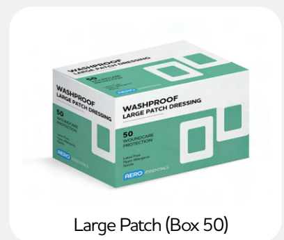
Large Patch (Box 50)