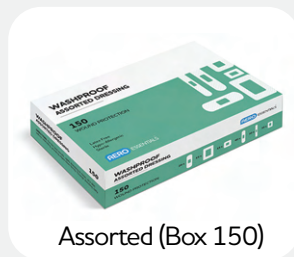
Assorted (Box 150)