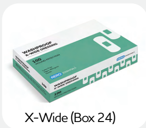
X-Wide (Box 24)