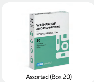
Assorted (Box 20)