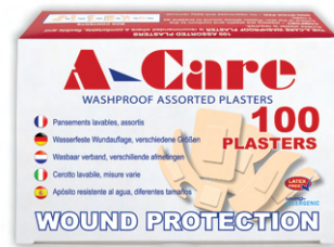
ACP106 – Assorted (Box 100)