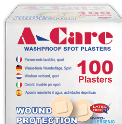
ACP203 – Spot (Box 100)