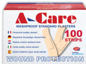
ACP100 – Strip (Box 100)