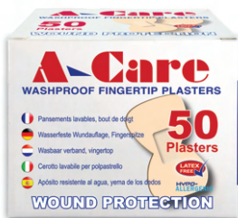
ACP102 – Fingertip (Box 50)