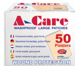
ACP101 – Large Patch (Box 50)