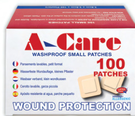
ACP105 – Small Patch (Box 100)