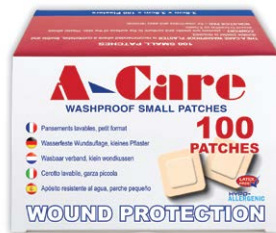
ACP105 – Small Patch (Box 100)