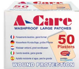
ACP101 – Large Patch (Box 50)