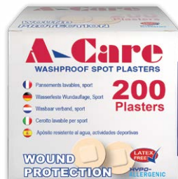
ACP203 – Spot (Box 200)