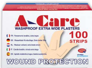
ACP201 – Extra Wide (Box 100)