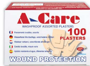
ACP106 – Assorted (Box 100)