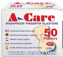
ACP102 – Fingertip (Box 50)