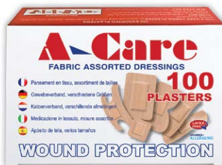
ACF106 – Assorted (Box 100)