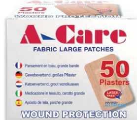
ACF101 – Large Patch (Box 50)