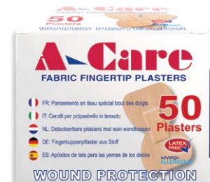
ACF102 – Fingertip (Box 50)