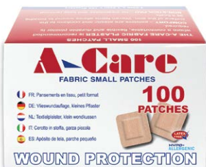
ACF105 – Small Patch (Box 100)