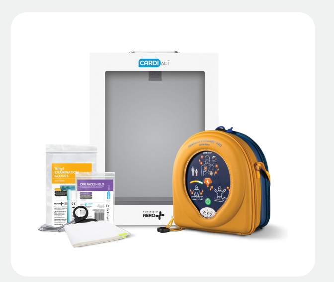
500P Silver Bundle