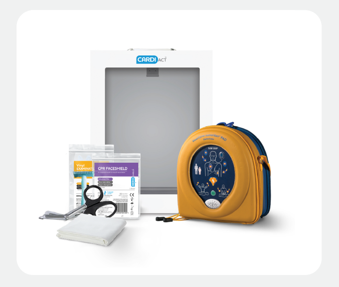
350P Silver Bundle