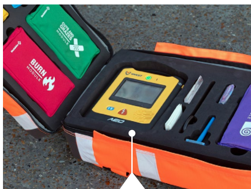
Thermal Insulation Foam for the AED to function in the cold