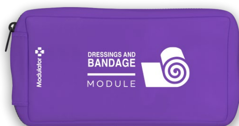
DRESSINGS AND BANDAGE MODULE