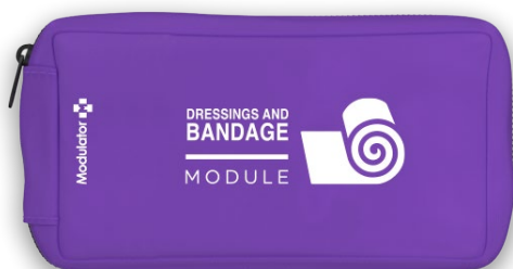
DRESSINGS AND BANDAGE MODULE