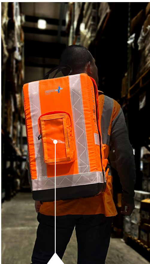
Prominent space for Asset Tags to be displayed front and back