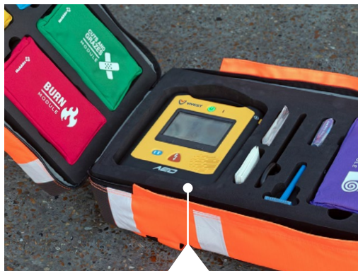
Thermal Insulation Foam for the AED to function in the cold