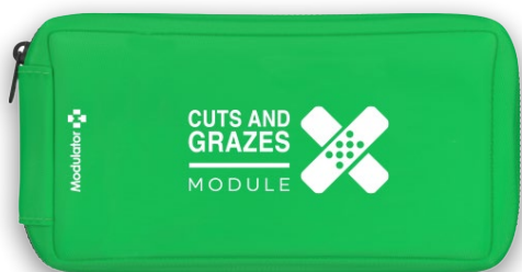
CUTS AND GRAZES MODULE