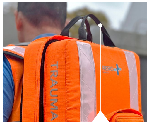
Reinforced Carry Handles