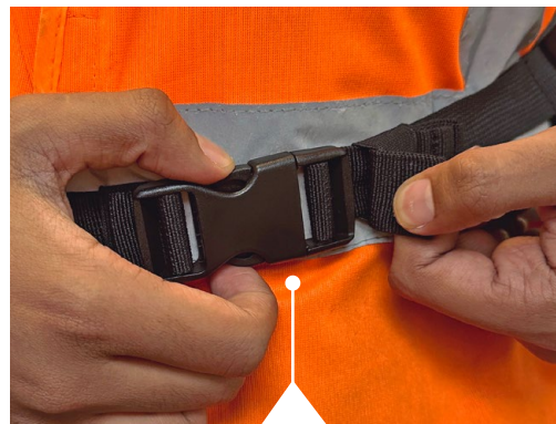
Quick Release Buckle allowing it to be easily detached