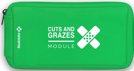
CUTS AND GRAZES MODULE