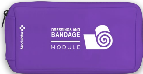
DRESSINGS AND BANDAGE MODULE