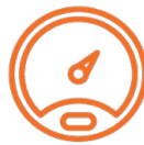
Working Load Limit