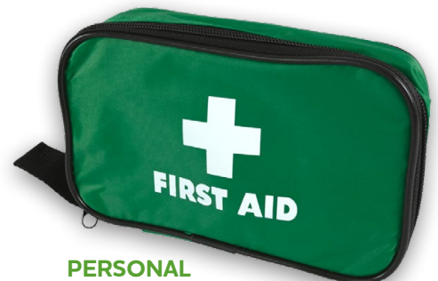
PERSONAL FIRST AID KIT